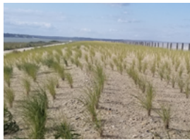
Dune Re-Nourishment Duxbury, MA