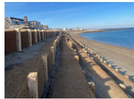
Coir Envelopes Sandwich, MA