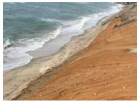
Coir Fiber Rolls & Netting Nantucket, MA