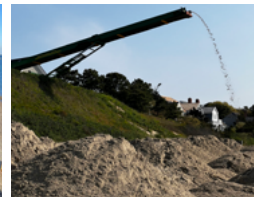
Maushop Village Beach Nourishment Mashpee, MA