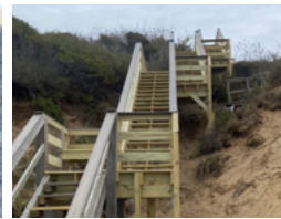
Beach Access Stair Set Truro, MA