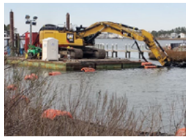
Whitcreek Hydraulic Dredging & Beneficial Use Sussex County, DE