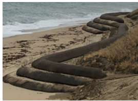
Coir Envelopes Nantucket, MA