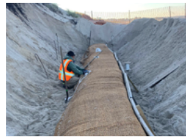
Coir Envelopes Sandwich, MA